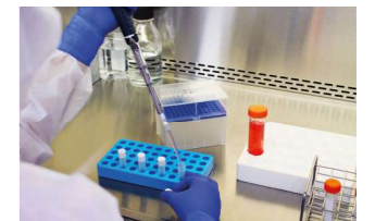
Culturing immune cells

proceed with our drug development by doing everything from scratch it would take a tremendous amount of time. Therefore the optimal strategy is M&As."